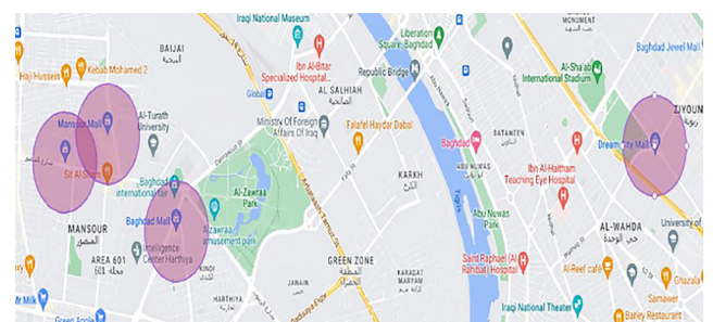
Fig. 1 Study area

A buffer was fixed around the mall location to 2 km to classify each land use. Each area was classified according to specific land use. For a catchment area with a diameter of 2 km around the malls, eight classes of land use types were found to estimate the intensity of each land use.